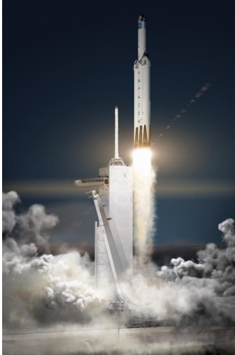
[Taken Feb. of 2016. Space X. Launch of Falcon Heavy cargo rocket.]

Although still relatively in planning phase, Space X announced on ambitious project to put Earth tourists in space by 2018.